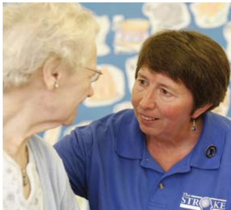
A member of the Stroke Association team at work

The Stroke Health Promotion Service is part of a range of rehabilitation and support services developed to meet the needs of people affected by stroke, their carers and family.