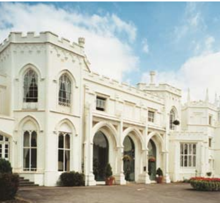
The Priory hospital, Roehampton

Systematic engagement between the Priory tier four service and community CAMHS teams across the boroughs was initiated. These regular clinician-to-clinician meetings enhance collaborative working.