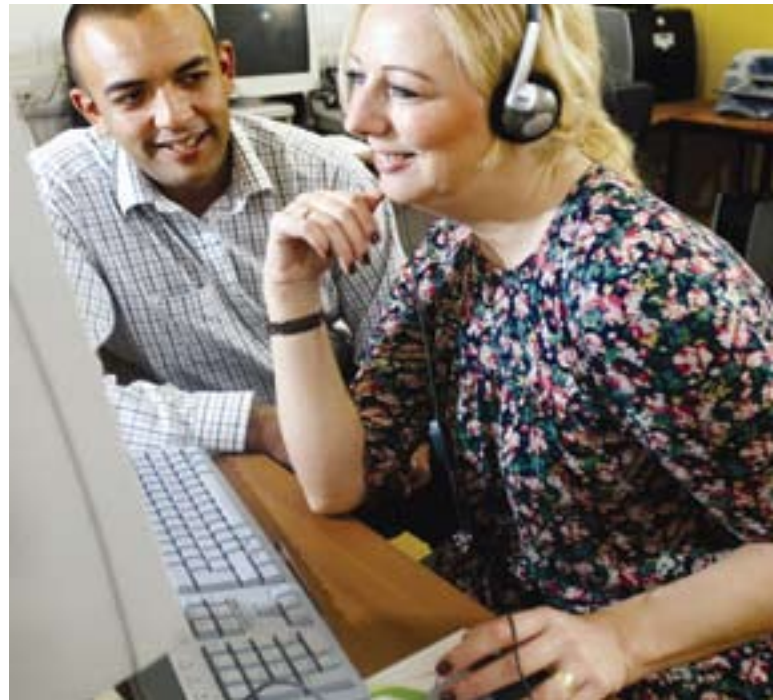
Email and texting are used to contact bank personnel about shift availability

CINA provides real time access either at home or work for bank personnel to view shifts available