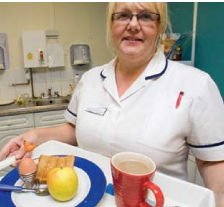
Personal care assistants undertake both social and healthcare duties

The service is an integral part of community services in Leeds managed by the PCT and accessed through the district nursing service. The service works in conjunction with the service delivery framework in Leeds for palliative care patients. While staff are employed by the PCT, employment costs are currently split equally between Marie Curie Cancer Care and the PCT.