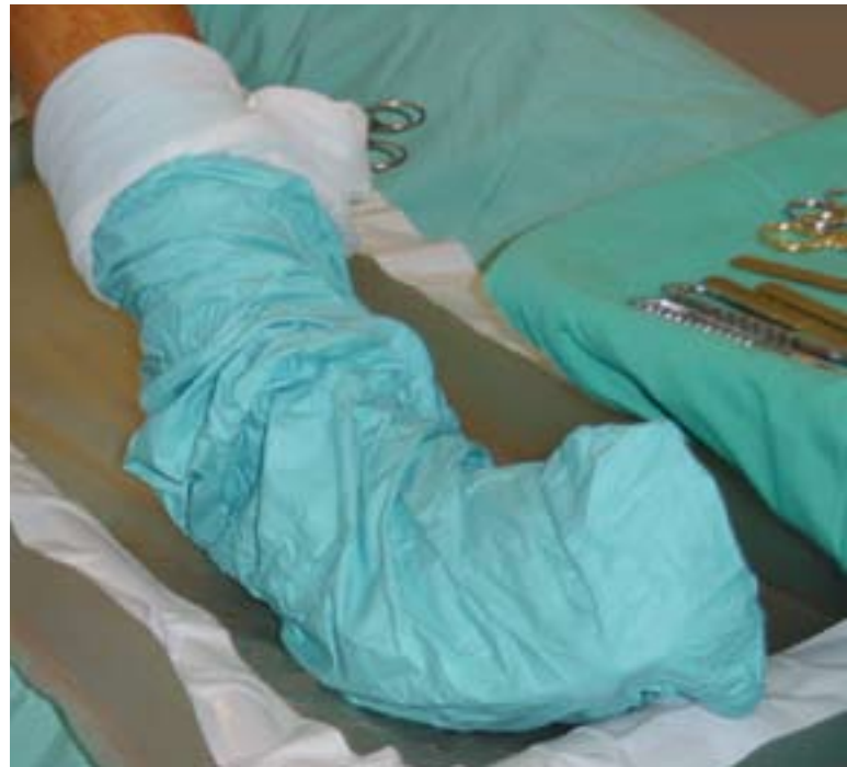
The P3 Lavage Tray collects spillages during surgery, reducing the risk of infection

"An estimated 20 to 30 per cent cost saving in turnaround and early discharge of patients is anticipated."