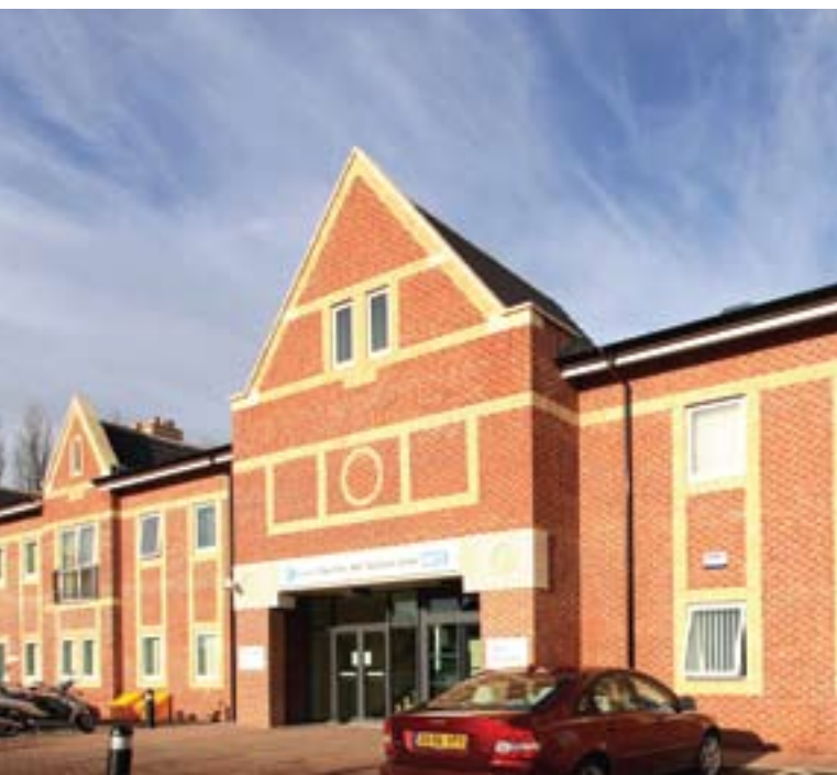
Clifton Park NHS Treatment Centre, York

Clifton Park has exceeded expectations, treating even more NHS patients than anticipated and achieving a consistently high level of patient satisfaction.